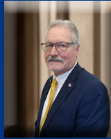
James Bulkley City of Columbus Mayor