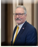
James Bulkley City of Columbus Mayor