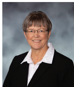
Deb VanMatre Mayor of Gibbon