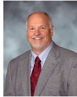
Scott Getzschman Mayor of Fremont